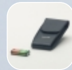
2 x AAA Batteries & Leather Pouch