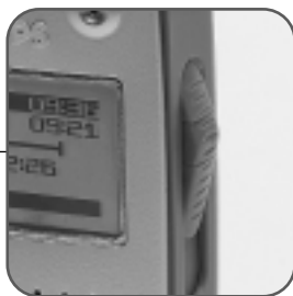
4-Position Switch for single-handed operation