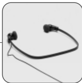
Headset for clear, confidential playback