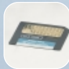
SmartMedia card 9008

Included in the Digital Starter Kit 9480: