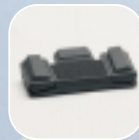
Foot Control 210