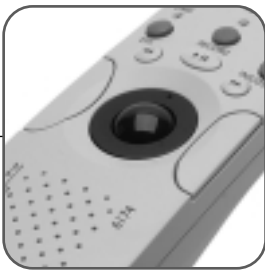
Trackball and trigger buttons operate like a normal mouse