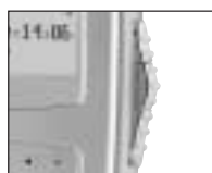
4-position switch for single-handed operation.